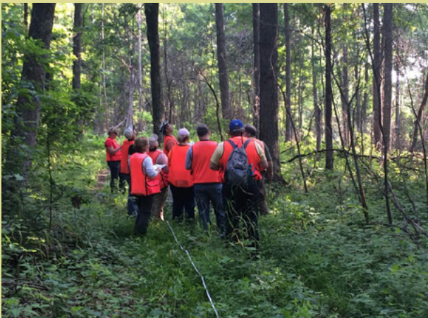
Participants of the Natural Resources Teachers' Institute learning tree inventory techniques

On June 23rd, teachers taking part in the Indiana Natural Resources Teachers' Institute coordinated by Project Learning Tree, Indiana DNR, and Purdue FNR Extension spent the morning learning about the research that takes place at the HEE. The teachers visited a few of the HEE research areas and got hands-on experience taking measurements and collecting data that are routinely collected at the HEE. The teachers spent the rest of the week-long program learning about various aspects of forest ecology, management, and the forestry industry. At the end of the week, teachers left with various resources that they can utilize in their classrooms.