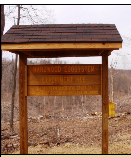
This sign is located at the Unit 3 clearcut along the main forest road at Morgan-Monroe State Forest. The HEE brochures are available at this sign as well as at the Morgan-Monroe and Yellowwood forest offices.